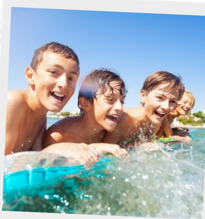
Creating lifelong friendships