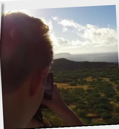
Expand your horizons